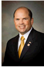
Senator Frank Antenori

The September 14th Pima GOP After Hours will be cancelled as to not conflict with the Sabino Teenage Republican Club's Tucson Mayoral and Council Candidate Forum. We'll be back in action at Pima GOP Headquarters on September 28th when Senator Frank Antenori will explain his Congressional Exploratory Committee.